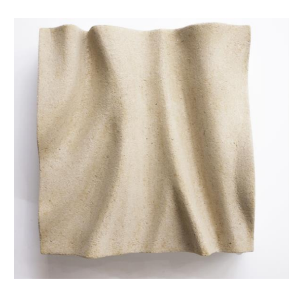
Figure 4. Designed exhibition piece, large sample 20 x 20 cm.

Surface geometry. Three-dimensional shapes can invite touching of the material. This experience can be designed in advance by designing fascinating shapes. The moulding technique enables the making of the three-dimensional shapes, repeatable forms or extremely smooth designed surfaces, manufactured at one time. In this study, the surface geometry has been studied by making regular pattern-like forms, regular free-formed shapes and complete free-form surfaces. Shaping was successful and easy to implement using the selected technique.