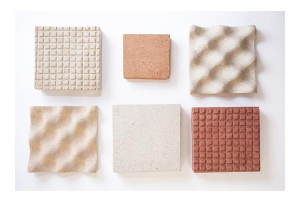
Figure 5. Small material samples and test pieces, sizes 5 x 5 cm and 10 x 10 cm.